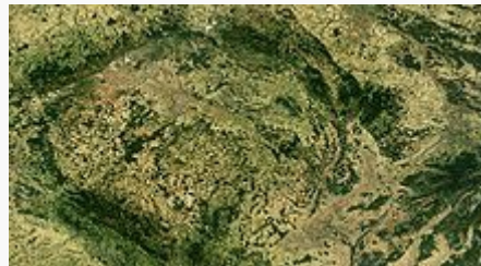
Satellite image of the Czech Republic

Terrain: Bohemia in the west consists of rolling plains, hills, and plateaus surrounded by low mountains; Moravia in the east consists of very hilly country