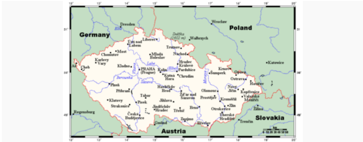
Map of the Czech Republic